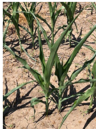
Figure 2. Corn plants at six leaf vegetative growth stage under heat and moisture stress.

Producers should rely on stored soil moisture and natural precipitation as much as possible during the early growth stages as an early irrigation can also cool the soil and delay seed germination and early growth.