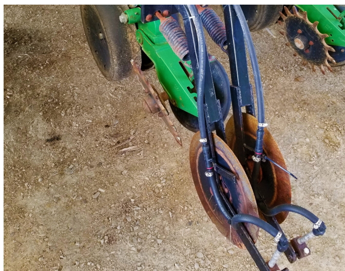
Figure 2. Starter fertilizer application system on row planter.