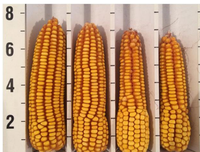
Figure 1. Ears showing reduced kernel row number. Kernel row number at the base of each ear developed normally until an ALS herbicide was applied. The two ears on the right were affected more than the left two ears. This could be a result of the amount of herbicide absorbed by the plant.

Kernel row number at the base of each ear developed normally until an ALS herbicide was applied. The two ears on the right were affected more than the left two ears. This could be a result of the amount of herbicide absorbed by the plant.