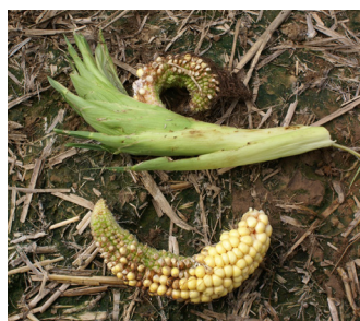
Figure 15. Curved ears caused by the injection of toxins by stink bugs on immature ears.