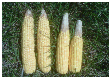
Figure 10. Aborted ear tips.