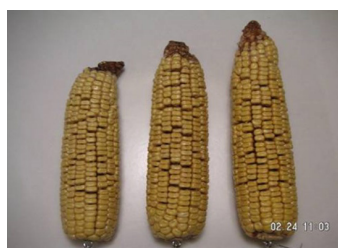
Figure 13. Chaffy Ears.