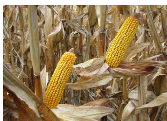
Figure 12. Unfilled corn tips from cob lengthening after pollination and ample rainfall.