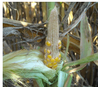
Figure 5. Poor kernel set resulting from drought stress