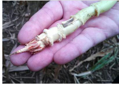
Figure 3. Blunt ear syndrome ears.