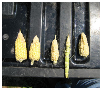
Figure 4. Blunt ears caused by late applied fungicide application.