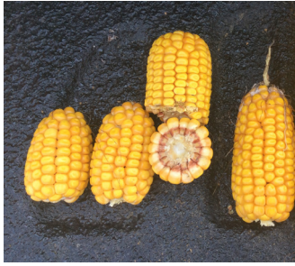
Figure 2. Blunt ear syndrome.