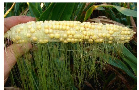
Figure 7. Poor kernel fill resulting from rootworm beetle silk clipping.

the syndrome can be caused by an application of a nonionic surfactant (NIS) prior to tasseling with or without a foliar fungicide. 3,4 The greatest risk for occurrence appears to happen from V12 to V14 growth stages (about one to two weeks before pollination). 4 Husks are slender and pointed which restricts silk emergence.