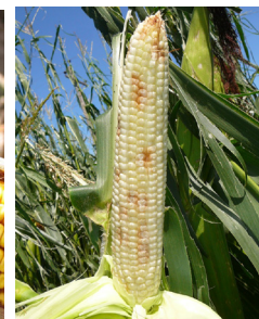
Figure 18. Kernel bruising from hail stones. Damaged kernels may be discolored and small, cease development, and/or become moldy.

Additionally, because of the damage, individual kernels or parts of the ear may develop kernel or ear rot.