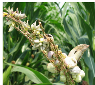
Figure 21. Common smut on tassel ear.