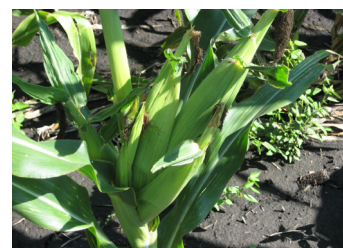
Figure 14. Bouquet ears.

and insects are among the causes. Additionally, high plant population, severe potassium deficiency, and hail damage can be possible causes. 1