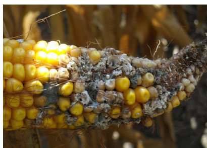
Figure 16. Ear tip damaged by corn earworm feeding. Fungal growth is present because of the initial feeding.