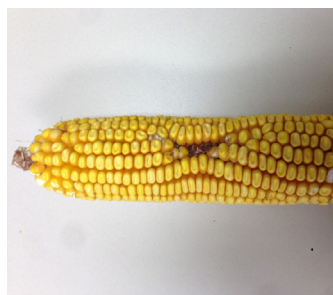
Figure 19. Kernel void resulting from hail stone strike.

Characterized by random kernels with a clear liquid appearing among normal appearing kernels on a normal sized ear (Figure 22). The abnormal kernels collapse during kernel maturation leaving behind a shriveled shell. The syndrome has been attributed to a late glyphosate herbicide application. 1,6