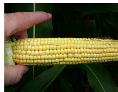
Figure 22. Clear or translucent kernels that are collapsing among kernels that are developing normally.