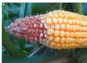
Figure 11. Unfilled ear tip. Note the white and shriveled aborted ovules.