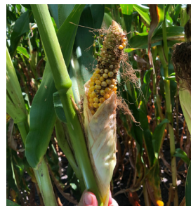
Figure 6. Poor ear fill from unidentified stress.