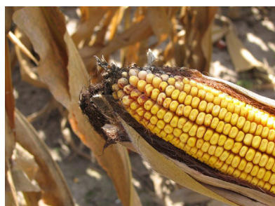
Figure 17. Kernel red streak caused by toxins released by wheat curl mites while feeding.