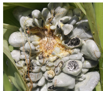
Figure 20. Common smut engulfing corn ear.