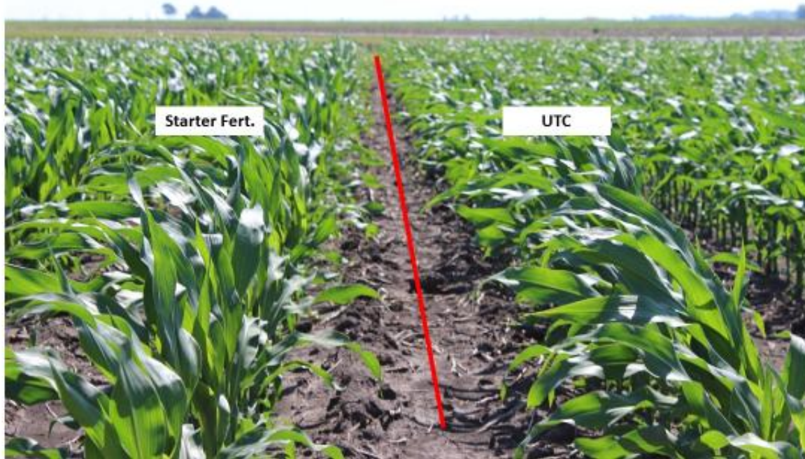
Figure 2. Corn receiving starter fertilizer may have a visual difference (left) compared to untreated check (UNT).