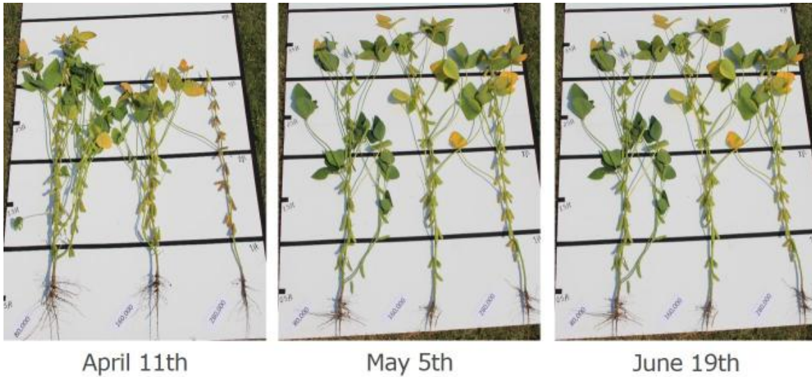
Figure 2. Soybean plants from three planting dates and three seeding rates. Each image shows a plant from the 80K seeds/acre (left), 160K seeds/acre (middle), and 280K seeds/acre (right) seeding rate.