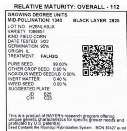
Figure 3. Quality control information contained in seed tags includes the seed lot number, physical purity scores, and the date and score of the warm germination test. Also included are planter recommendations for the specific seed type.

This test utilizes molecular analyses to ensure that the product contains the herbicide and insect traits at the correct labeled levels.