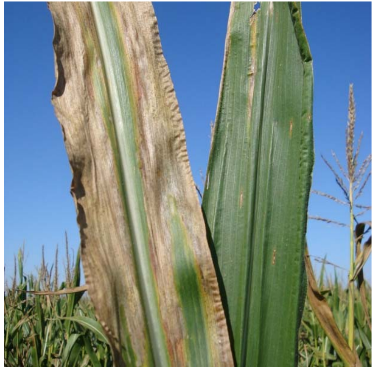
Figure 3. Differences in the severity of Goss's wilt infection on leaves of a susceptible and a resistant corn products from Monsanto. Resistance restricts the area of leaf tissue colonized by Cmn.

In response to the increased prevalence of Goss's wilt, Monsanto has committed special efforts to develop new corn products with increased tolerance to the disease in all geographies. Large screening nurseries have been established in many areas where the disease is present that provide an opportunity for corn breeders to assess the response of an individual corn product to Goss's wilt under different environments and differing levels of disease severity. Monsanto corn products are assigned a tolerance rating based on their response to the disease across all geographies. Disease tolerance ratings range from 1 to 9, with 1 being excellent resistance and 9 being poor resistance.