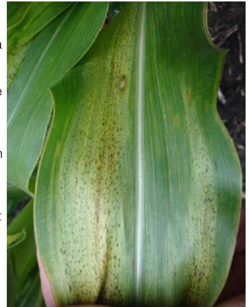
Figure 1. Early symptoms of Goss's wilt with leaf freckles.

Factors that prevented Goss's wilt from becoming a widespread and significant disease throughout the entire Corn Belt in the 1980s also explain why the disease has made a comeback in recent years. Goss's wilt did not become widely established in parts of the corn belt during the 1980s due to the predominant production practices of that period, which included clean fall plowing; whereas conservation tillage had been a common practice for decades in the western Corn Belt where the disease was a significant problem.