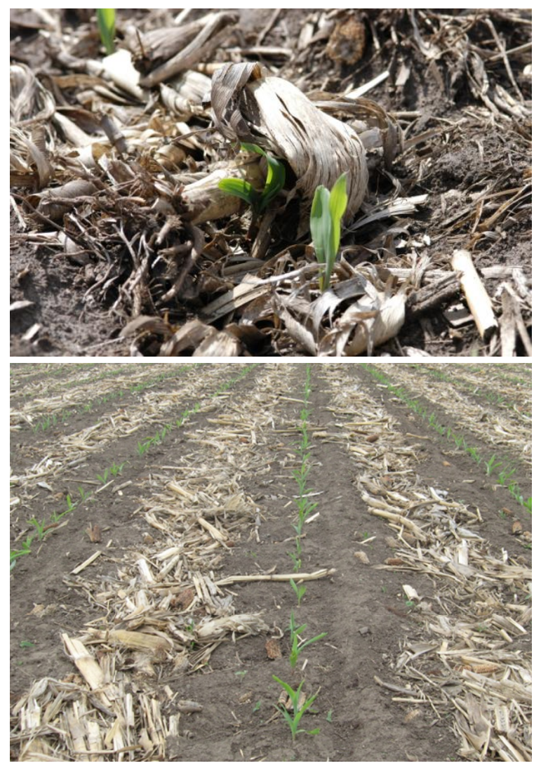
Figure 2. Strip-till may be used to remove residue from the row for avoiding problems with seedling emergence; however, it does not necessarily increase the rate of residue decomposition.

<sup>6</sup> Al-Kaisi, M. 2007. Tillage challenges in managing continuous corn. Iowa State University. IC-498(1).