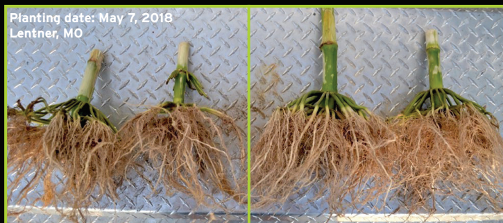
Acceleron ® Seed Applied Solutions BASIC

Can increase water & nutrient uptake through the roots