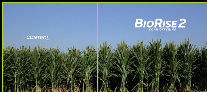
Acceleron ® Seed Applied Solutions BASIC + BioRISE ™ 2 Corn Offering