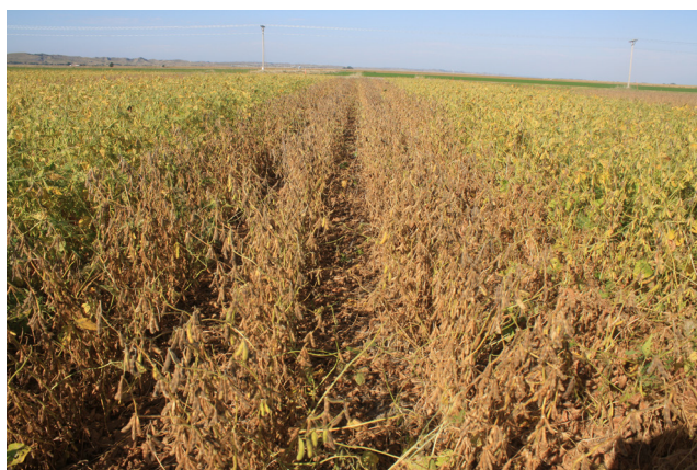
Figure 2. Image of the 2.0MG product in the +Boron fertigation treatment.