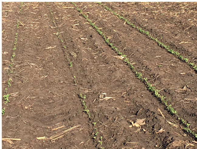
Figure 2. The two rows on the left are untreated, the two rows on the right are treated with Acceleron® Seed Applied Solutions STANDARD.