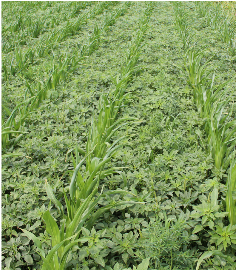
Figure 1. Non-treated plot containing Palmer amaranth and kochia.