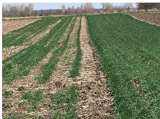
Figure 1. Field picture showing the established cereal rye cover crop used for the trial. Dense vegetation on the right is the early established cover crop and the sparse vegetation on the left is the late established cover crop. Picture was taken just before soybean planting.