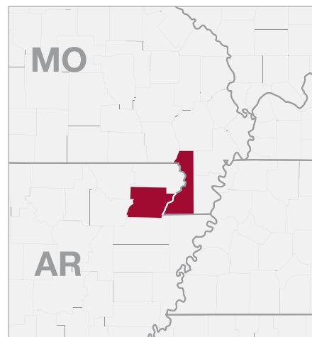
DaVault Farms includes 7,500 acres across Greene County, Arkansas, and Dunklin County, Missouri