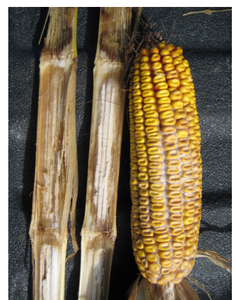
Figure 23. Diplodia ear and stalk rot.