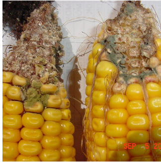
Figure 28. Aspergillus ear rot on left and Penicillium ear rot on right.