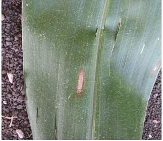
Figure 4. Gray leaf spot.