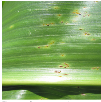
Figure 8. Corn rust on the underside of a corn leaf.