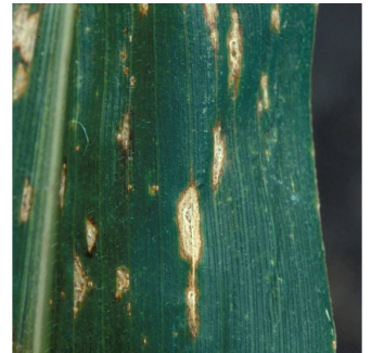
Figure 6. Anthracnose leaf blight.