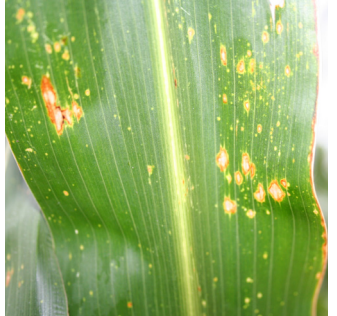
Figure 10. Southern corn leaf blight.