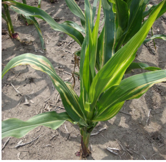
Figure 5. Late-season symptoms of Stewart's wilt on a corn leaf.