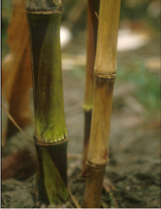
Figure 13. Fusarium stalk rot.