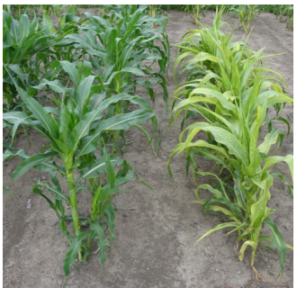
Figure 18. Maize dwarf mosaic virus in field.