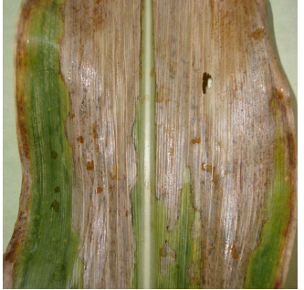
Figure 1. Goss's wilt bacterial exudate on leaf surface.