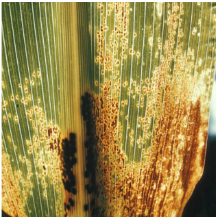
Figure 20. Physoderma node rot.