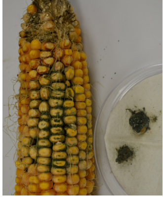
Figure 27. Trichoderma ear rot.