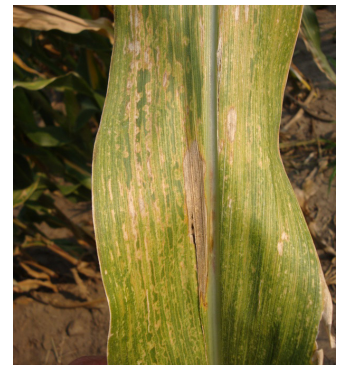
Figure 17. Corn lethal necrosis.