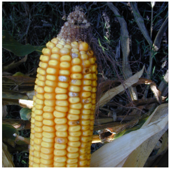
Figure 24. Fusarium ear rot.