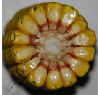
Figure 26. Cladosporium ear rot.