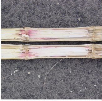
Figure 11. Gibberella stalk rot.