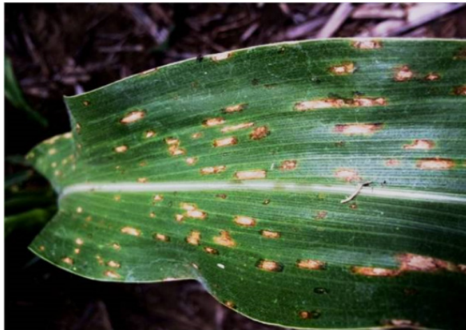
Figure 1. Gray leaf spot infection on corn.

Environmental conditions that allow expansion of GLS are temperatures between 77 and 86° F and high humidity and moisture. In addition to conducive environmental conditions, the susceptibility level of the corn product will also dictate lesion expansion.