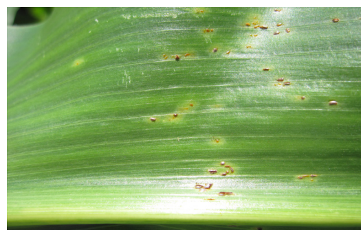
Figure 6. Common rust pustules on underside of corn leaf.