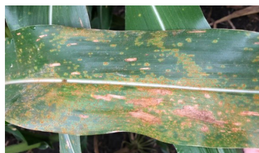
Figure 7. Southern rust on corn.