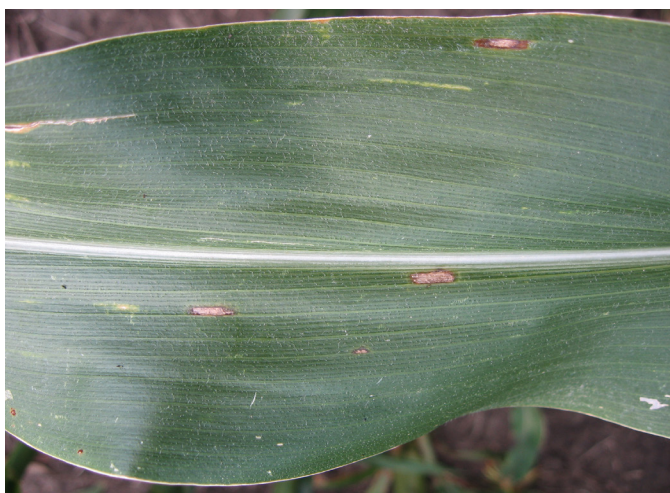
Figure 3. Grey leaf spot.