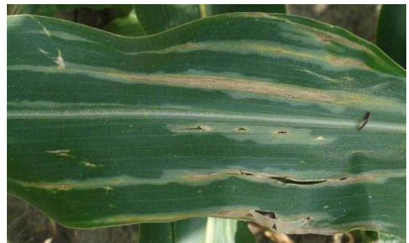
Figure 9. Stewart's wilt of corn.