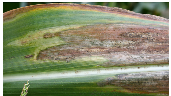
Figure 10. Goss's wilt of corn.