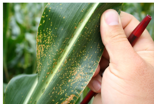
Figure 5. Corn eyespot.