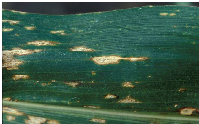
Figure 1. Anthracnose leaf blight.

Grey leaf spot. Grey to tan, rectangular lesions on leaf, sheath, or husk tissue (Figure 3). Spots are opaque and long (up to 2 inches). Lower leaves are affected first, usually not until after silking. Lesions may have a grey, downy appearance on the underside of leaves where the fungus sporulates. Grey leaf spot has become more prevalent with increased use of reduced tillage and continuous corn.