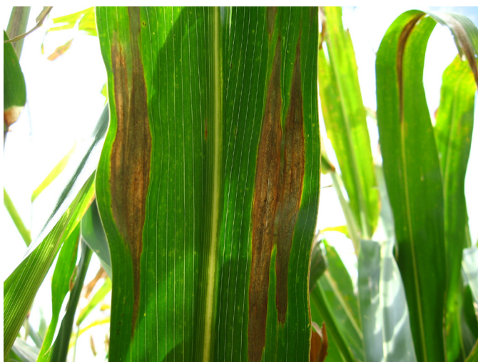
Figure 2. Northern corn leaf blight.