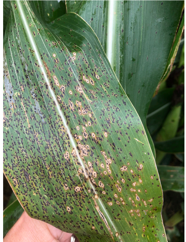
Figure 8. Tar spot of corn.

Goss's wilt. The leaf blight symptoms of Goss's wilt usually appear as long, grey-green to black, water-soaked streaks extending along leaf veins. Small, dark, water-soaked flecks, referred to as "freckles", often occur inside larger lesions and at the edges of lesions where symptoms are advancing. Leaf freckles are luminous when lighted from behind, such as when the sun is used as backlighting. Bacterial cells may ooze from infected leaves and dry on leaf surfaces forming a shellac-like sheen. As lesions mature, large areas of tan to brown, dead leaf tissues are visible (Figure 10).