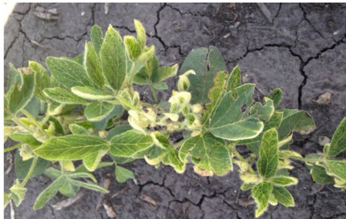
Figure 6. HPPD (Group 27) corn herbicide carryover to soybean.

It is important to note that corn injury from fomesafen carryover has become an increasing problem. Fomesafen herbicide products are used in soybean crops to help manage tough-to-control weeds like waterhemp and Palmer amaranth and can result in multiple and late-season applications. Fomesafen is relatively persistent, and when less than average late-season rainfall occurs, the product can carryover into corn as a rotational crop. Dry and cold weather during the fall and winter can reduce herbicide dissipation and contribute to a carryover problem. The primary symptom of fomesafen injury is striped leaves due to chlorotic or necrotic veins on the leaves. Other factors can cause striping on leaves, but fomesafen is unique in that the veins are affected rather than interveinal tissue.