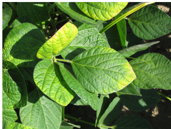
Figure 10. Injury from glufosinate to soybean.

Glutamine synthetase inhibitors (Group 10) (example: glufosinate): Glufosinate can be applied postemergence in glufosinate-resistant soybean, though misapplication of glufosinate on glyphosate-resistant soybean will cause significant injury. Chlorosis and wilting of the soybean plants can be observed within three to five days after application, followed by necrosis in one to two weeks. These symptoms can mostly be observed on older leaf tissues. Bright sunlight, high humidity, and moist soil can increase the intensity of glufosinate injury on soybean plants that are not tolerant to glufosinate.