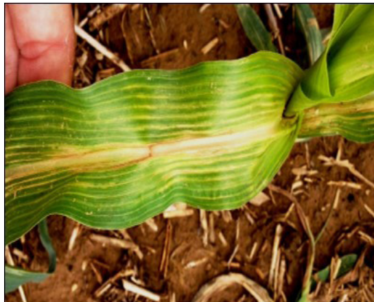
Figure 7. Corn injury from carryover of fomesafen. The primary symptom is striped leaves due to chlorotic or necrotic veins on the leaves.

Fall-planted crops and cover crops may also have limited tolerance to some herbicide residues. Cropping plans may need to be changed in fields where carryover could occur. Good weed management planning and recordkeeping is necessary to help minimize potential carryover to rotational crops.