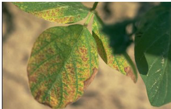
Figure 4. Interveinal chlorosis (yellowing) and necrosis (browning) of older soybean leaf tissue may result from the use of triazine herbicides such as metribuzin or the carryover of herbicide residues of atrazine or simazine.

PPO inhibitors (Group 14) (examples: sulfentrazone, flumioxazin): Injury is most likely when rain increases herbicide availability as the hypocotyl approaches or emerges through the soil surface. Symptoms include necrotic lesions on the cotyledons and hypocotyl, and often are more severe in poorly-drained areas of the field. With severe injury, the hypocotyl can be girdled, resulting in plant death. Herbicide contact with the apical bud results in malformed leaves and occasionally death of the primary stem. In most cases yield is not affected by damage, except in cases where the hypocotyl is girdled, or apical bud is damaged.