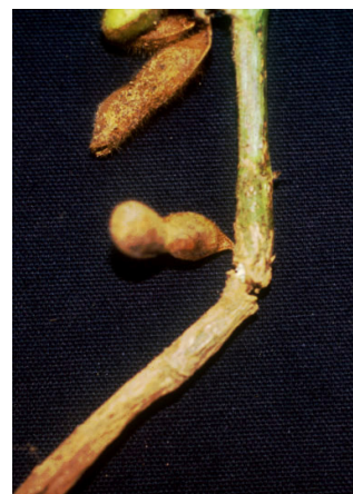
Figure 3. Sometimes a preemergence application of dinitroaniline herbicides can cause callus tissue to form on the plant stem near the soil surface. This can result in a brittle stem and plant lodging.