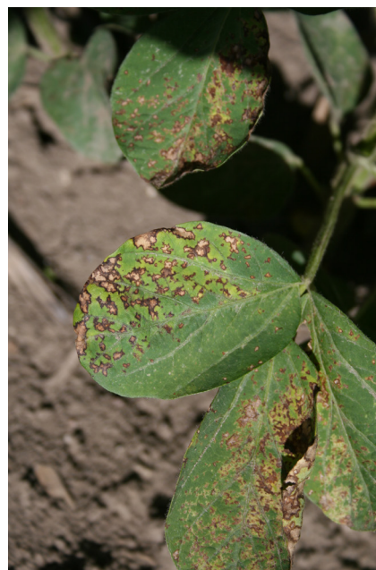
Figure 12. Leaf speckling caused by lactofen injury to soybean.