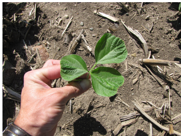
Figure 11. Acetochlor injury to soybean.

PPO inhibitors (Group 14) (examples: lactofen, fomesafen, acifluorfen): Postemergence herbicide applications with PPO-inhibiting herbicides may result in soybean injury, specifically during hot and humid weather. Tank contamination and drift can sometimes result in PPO inhibitor herbicide injuries to soybean. Injury symptoms range from bronzing and speckling of the leaves to necrosis of the leaf tissue. PPO inhibitors are contact herbicides, and symptoms can be observed on the fully opened leaves at the time of herbicide application. Lactofen injury to soybean can appear 7 to 14 days after herbicide application, but soybean plants can usually overcome injury symptoms 21 to 30 days after herbicide application without yield loss.