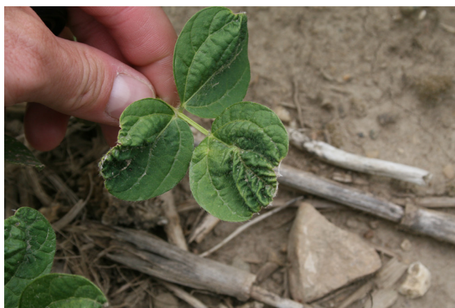
Figure 5. Heart-shaped leaflets on soybean from metolachlor injury.

PPO inhibitors (Group 14) (examples: sulfentrazone, flumioxazin): Injury is most likely when rain increases herbicide availability as the hypocotyl approaches or emerges through the soil surface. Symptoms include necrotic lesions on the cotyledons and hypocotyl, and often are more severe in poorly-drained areas of the field. With severe injury, the hypocotyl can be girdled, resulting in plant death. Herbicide contact with the apical bud results in malformed leaves and occasionally death of the primary stem. In most cases yield is not affected by damage, except in cases where the hypocotyl is girdled, or apical bud is damaged.