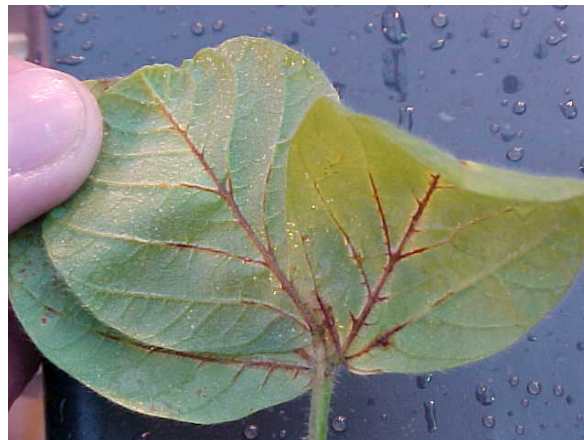
Figure 8. ALS injury to soybean.

Plant growth regulators (Group 4): (examples: 2,4-D, dicamba). Soybean plants are sensitive to plant growth regulator herbicides if they do not contain herbicide tolerance traits for the specific herbicide being considered. Several herbicides from this site of action group are volatile, and the misapplication or drift of these herbicides may cause injury to soybean plants or other sensitive plants. As these herbicides are systemic in nature, soybean injury can be observed on newly developed tissues or leaves. Injury symptoms include epinastic (downward) bending or twisting of the stems and petioles, along with leaf cupping and curling. Leaf shape and venation are often abnormal after exposure to plant growth regulator herbicides, followed by chlorosis of young leaves, and wilting. It may take two to four weeks to kill soybean plants after an application of a plant growth regulator herbicide.