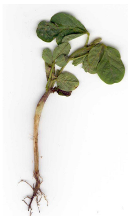
Figure 2. Excessive rates of dinitroaniline herbicides may result in seedling soybean with pruned roots and swollen or cracked hypocotyls.

Seedling root growth inhibitors (Group 3) (examples: pendimethalin, trifluralin): Injury from these herbicides can cause swelling of the hypocotyl, reduced root growth, and delayed emergence. Injury is most likely where cool, wet soils slow emergence, therefore increasing absorption of the herbicide into the emerging soybean. Occasionally, a preemergence application or shallow incorporation of dinitroaniline herbicides can cause callus tissue to form on the plant stem near the soil surface. This can result in a brittle stem and increased susceptibility to lodging.