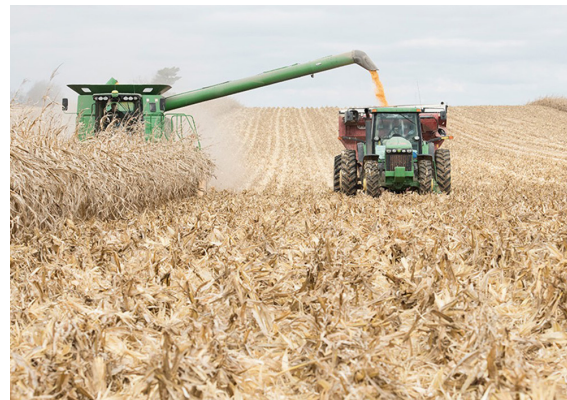
Figure 1. A combine harvesting a field of corn.