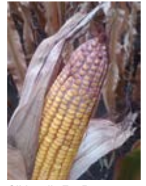
Gibberella Ear Rot