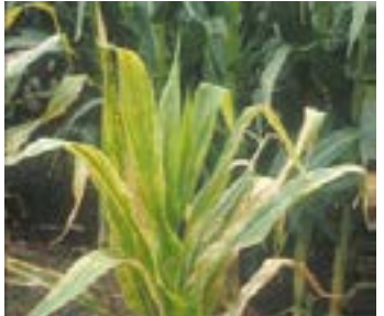
High Plains Virus