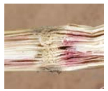
Gibberella Stalk Rot