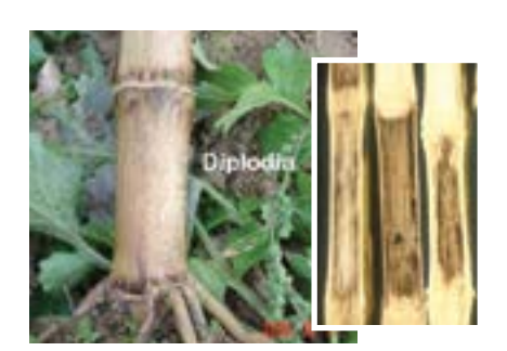
Diplodia Stalk Rot