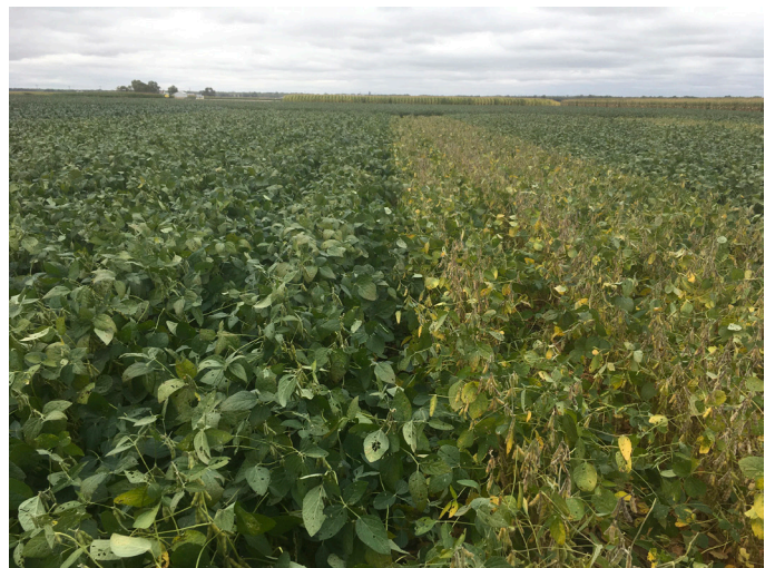
Figure 2. Planting date impact on soybean maturity. May 28 planting on the left is just starting to turn yellow while May 1 planting on the right is about 50% mature pod.