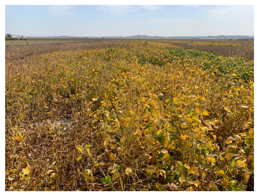
Figure 2. Representation of the planting date, soybean product, and seeding rates in August of 2020.