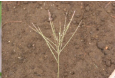
Large crabgrass collar region, left, and seedhead, right.