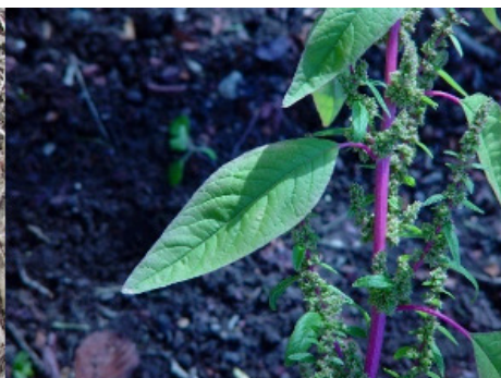
Common waterhemp seedlings (left) and stem (right).