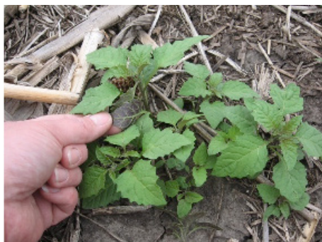
Eastern black nightshade.