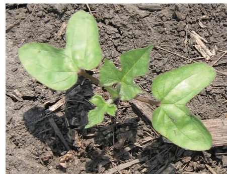
Morningglory species (ivy leaf morningglory pictured).

Seedlings photo on left courtesy of Stephen Gower.