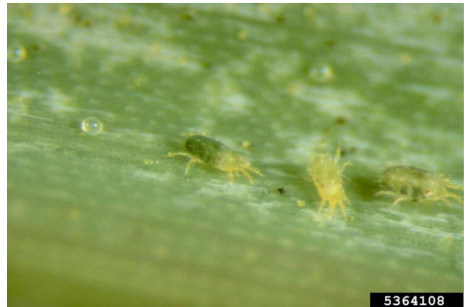
Figure 13. Banks grass mite.

The banks grass mite is most common in the western corn belt where low precipitation levels allow the population to expand rapidly. Banks grass mites are very small, about 1/32 inch in length. Their bodies are oval and vary from green to brown in color. They have eight legs and a row of dark spots, brown to reddish brown, on either side of the abdomen extending from near the head to the end of the abdomen (Figure 13). The number and position of the spots are one feature in distinguishing Banks grass mites and two-spotted spider mites.