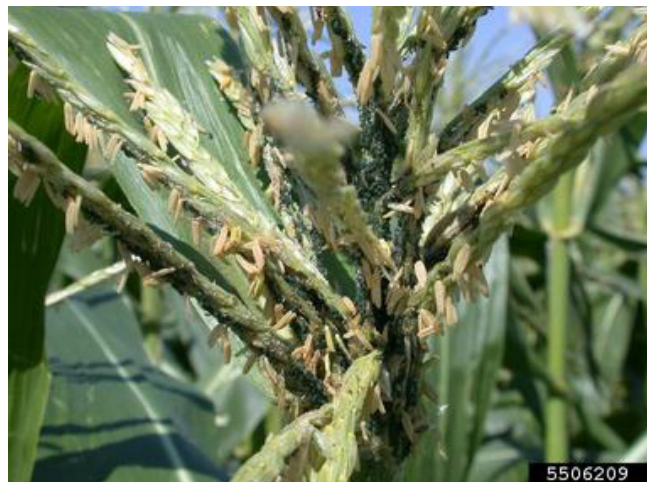
Figure 2. Corn leaf aphid.

The aphid is blue-green, pear shaped, and wingless (Figure 2). It has short antennae and purple spot at the base of the cornicles. Usually first found in the whorls spreading to the tassel later in the season.