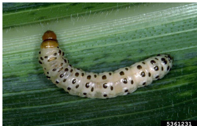
Figure 9. Southwestern corn borer.

The larvae are dull with black spots in regular pattern along the body. Interestingly, the spots are not present on overwintering larvae. There are two to three generations per year with the first generation feeding on the growing point, resulting in “dead heart”. The second generation feeds in the stalk and girdles the stalk above the soil line. This injury can result in lodging.