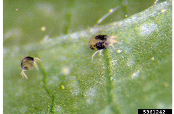
Figure 14. Two spotted spider mite.

The two spotted spider mite is more of an economic concern during hot dry weather, when populations can expand extremely quickly. Its host range includes a wide variety of plants, including corn.