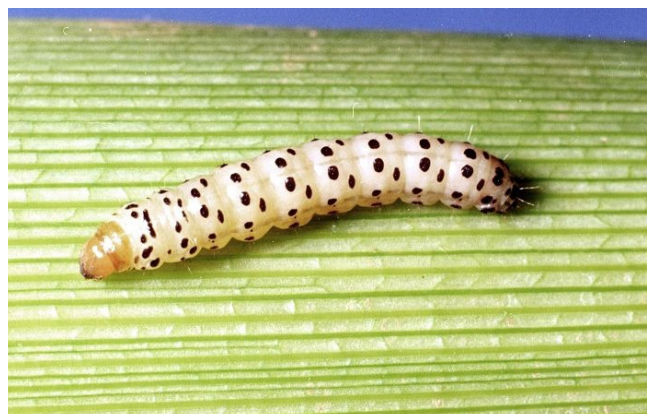
Figure 10. Southern cornstalk borer.

The southern cornstalk borer larva is creamy yellow during the winter and white with black spots in the summer and very similar to the southwestern corn borer. It attacks primarily maize but also feeds on grain sorghum and sugarcane. There are usually two generations each year although three generations can occur. Injury is similar to the southwestern corn borer. Tunneling may be extensive in the lower portion of the stalk, primarily just above the soil line, disrupting nutrient and water uptake.