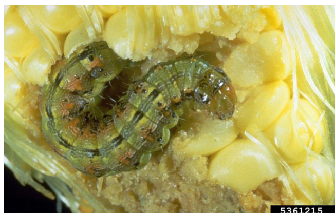
Figure 1. Corn earworm.

Unlike the Western bean cutworm, corn earworms are cannibalistic so rarely is there more than one per ear. This species has a wide color variation from black to green (Figure 1). Usually more of a significant pest of sweet corn than field corn.