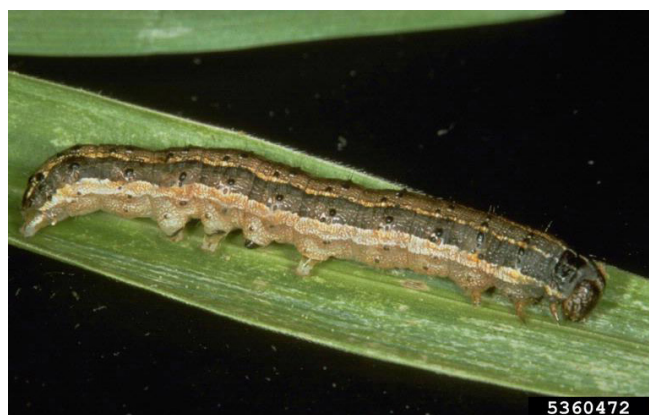
Figure 6. Fall Armyworm.

The identifying characteristic for the fall armyworm larva is the white inverted Y-shape suture between the eyes (Figure 6). Moths are usually attracted to late developing corn or late planted corn as they do not overwinter in the Corn Growing Region and fly into the Midwest from the southern states.