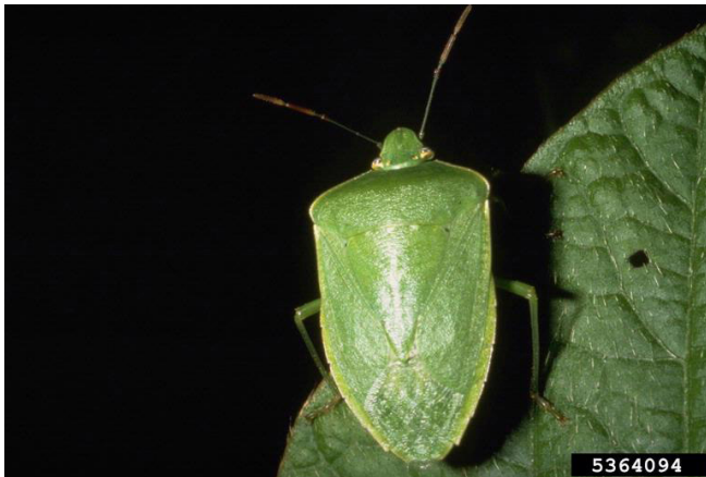
Figure 11. Green stinkbug.

Injury to corn is most severe when stink bugs feed on the immature ear prior to tasseling, but the damage becomes evident after pollination. The feeding injury causes the ear to be deformed. Feeding after pollination on developing kernels, while concerning is not as injurious as feeding on the developing ear.