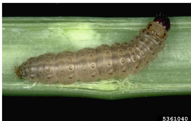
Figure 5. European corn borer.

Depending on geography, late season corn can be infested with European corn borer larvae from the single generation type (Northern locations) or larvae from second generation of the two generation type (majority of Midwest) (Figure 5). Larvae can be found in the stalk, ear, and ear shank. Scout for insect frass (excrement) in leaf sheaths, holes in the stalk, shank, or ear. Feeding can reduce nutrient and water transfer, increase risk of stalk diseases, and stalk lodging.