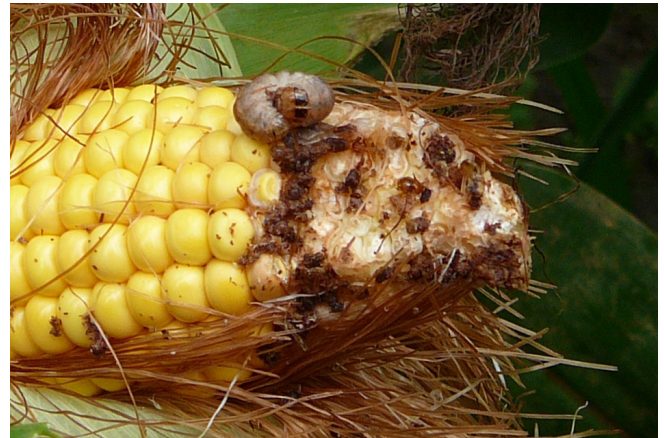
Figure 12. Western bean cutworm.

The western bean cutworm attacks the ear and can be identified by the brown bars behind the head (Figure 10/Figure 12). Typically, unlike corn earworm, more than one larva can be found in the ear.