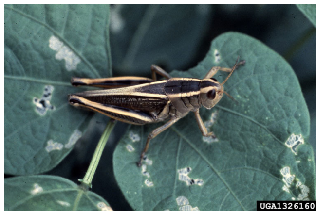
Figure 7. Two-striped grasshopper.

Early season injury is usually confined to field margins, but as the majority become adults, movement into the field increases. Grasshoppers feed on leaves, silks, and ear tips, and when populations are very high, the entire plant can become stripped.