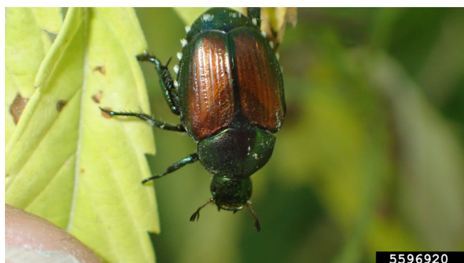
Figure 8. Japanese beetle.

The Japanese beetle can clip silks and injure developing kernels at the tip of the ear. Like adult corn rootworms, the silk clipping is rarely of economic concern.