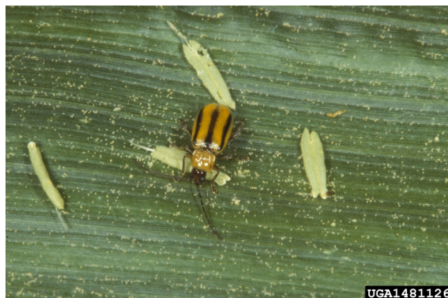
Figure 4. Western corn rootworm.