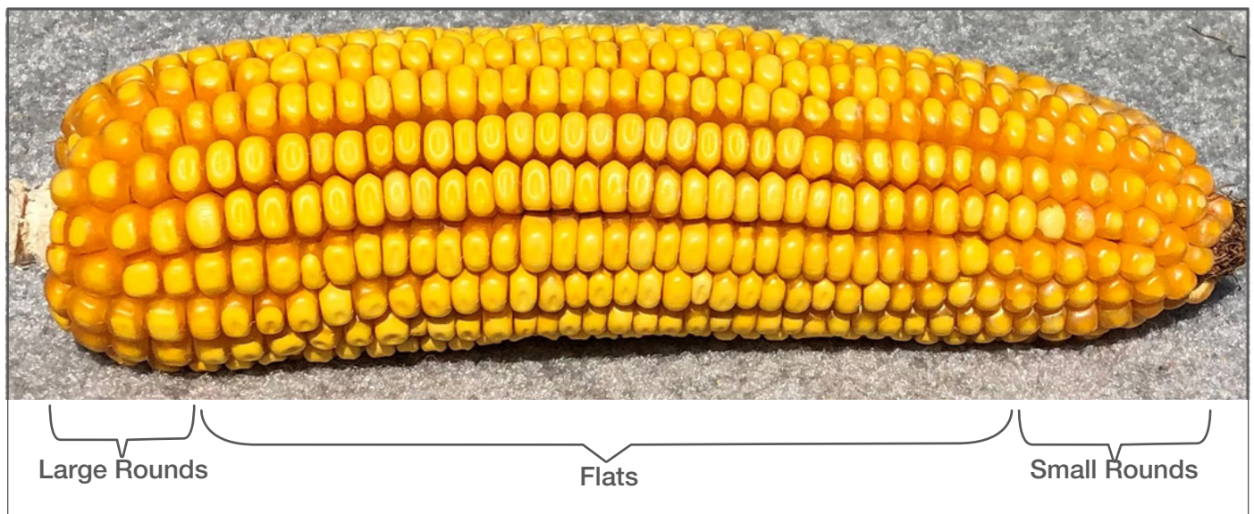
Figure 1. Seed size and shape on a corn ear varies from large rounds (left, ear base), flats (middle of ear), to small rounds (ear tip).

Though genetic yield potential is not affected by seed size, there can be differences in germination related to seed size under adverse planting conditions. Large seed can have slightly decreased emergence rates in dry soil conditions because large seed requires more moisture to germinate, compared to small seed. Small seed can have slightly decreased emergence in cool or crusted soils because the energy needed for emergence in these environments may be greater than the amount stored in the endosperm. The differences noted in early growth related to seed size are usually not apparent after tasseling.