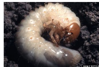
Figure 1. White Grub.