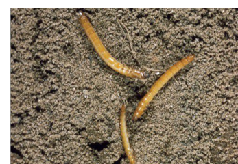
Figure 2. Wireworm.