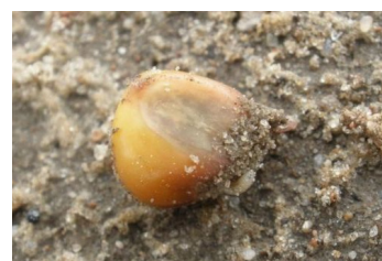
Figure 3. Seed corn maggot.