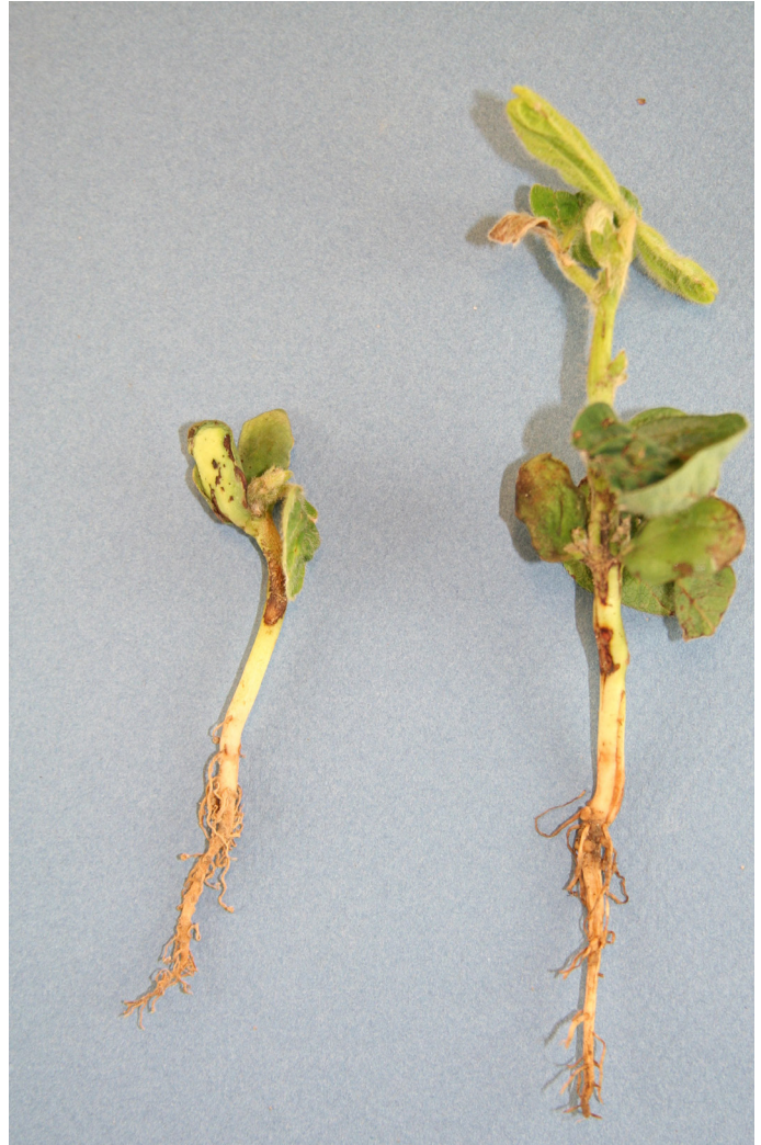
Figure 4. Injury to soybeans seedlings caused by a pre-emergence application of flumioxazin.

Pre-emergence, PPO-inhibiting herbicides are commonly applied as part of a pre-mix product used as additional modes-of-action to control a broad weed spectrum. The label states that these products are to be applied within three days after planting. If pre-emergence, PPO-inhibiting herbicides do cause damage to soybean plants, the signs of damage will often show up in cool, wet conditions that can slow emergence. Damage can also be observed if the growing season has been dry after planting, but the grower receives a light rainfall of 0.2 to 0.4 inches of moisture or applies a light irrigation just as the soybeans emerge through the soil surface. In this scenario, the dry post-planting conditions could have allowed the herbicide to remain on the soil surface and the following moisture could have moved the herbicide into the seed row and onto the emerging seedlings. The signs of PPO-inhibiting herbicide damage to the seedlings can vary, but often appear as a “burnt” reddish-colored spot to the side of the hypocotyl or on the already emerged leaves, which can often be confused with phytophthora root rot. 2 Always read and follow the herbicide label directions.