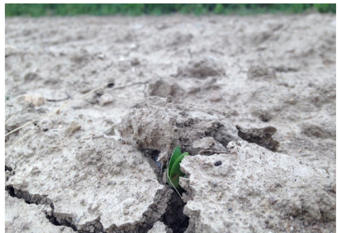
Figure 3. Soybean seedling emerging through a soil crust.

Note that more than one application may be required. Heavy rainfall or heavy irrigation can result in surface crusting if the soil surface dries out before emergence. A hard soil crust can delay or prevent seedling emergence and cause soybean hypocotyls to swell or break as they try to push through the crust. If a seedling's hypocotyl breaks or its cotyledons do not reach the soil surface, it will die. Fields with fine-textured soils, low organic matter, and little surface residue can be vulnerable to crusting, especially where excessive tillage has taken place (Figure 3). A light, center pivot irrigation application of less than an inch of moisture can also be used to soften soil crusts that may be present when seedlings emerge, softening the crust as the cotyledons break through the soil surface.