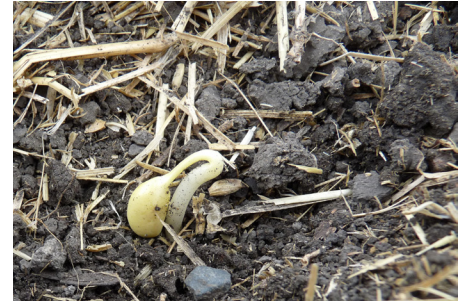
Figure 2. Soybean hypocotyl hook and cotyledons after emerging through the soil surface.

The epicotyl is the stem tissue just above the cotyledons. The epicotyl contains the first leaves, which are unifoliate (one leaf blade attached to opposite sides of the stem at the same node) (Figure 1). The first leaves open quickly to start the photosynthetic process. The first trifoliate leaves subsequently emerge from the growing point above the unifoliate leaves. After about a week, the cotyledons dry and drop off the plant because their stored energy has been depleted. Energy production in the soybean plant is now solely dependent on photosynthesis by the leaves.